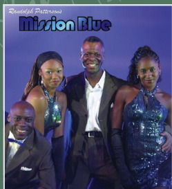
Friday 23rd September Motown – Mission Blue £26.50