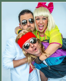
Saturday 22nd October 80s Band £26.50