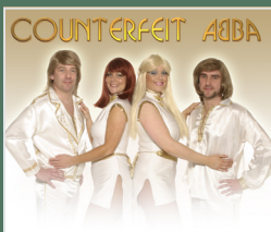
24th & 25th November ABBA £33.50